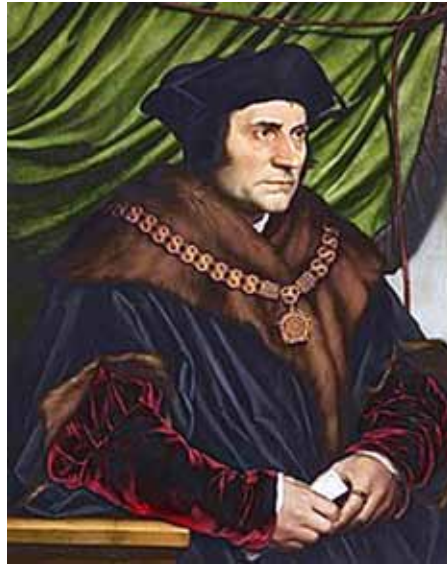
I die his Majesty's good servant, but God's first. St. Thomas More

life in this world, left his impact on the people of his time and still, five centuries later, continues to inspire us. Even the twentieth century agnostic playwright Robert Bolt portrayed Thomas More as the tragic hero of his 1960 play: A Man for All Seasons .