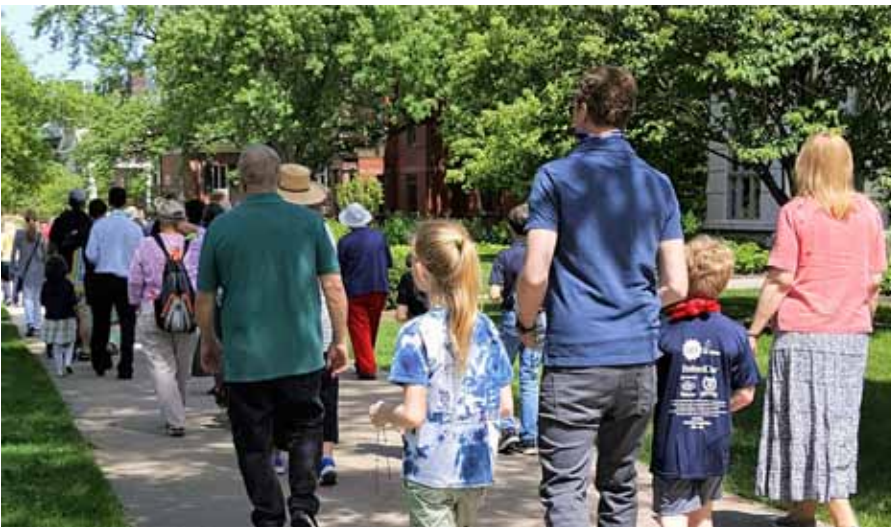
May 2020 CPO Rosary Procession

Catholic Church. There's good news for those who weren't able to attend the talk: you can watch a video of Father's talk at: catholicparents.org .