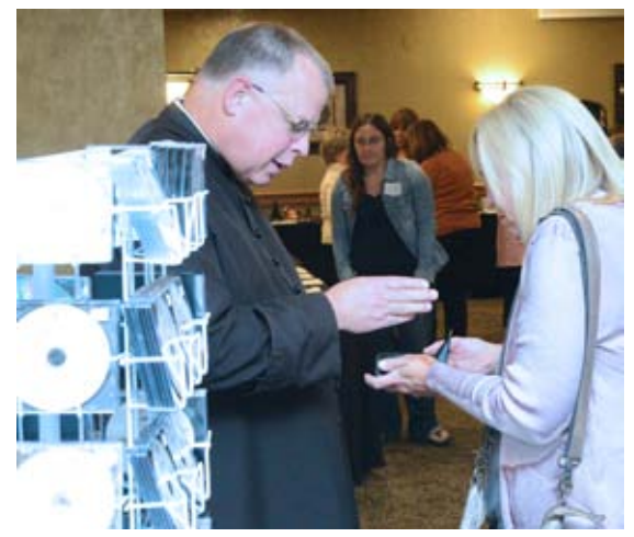
Father blessing religious article

CPO Luncheon and Fundraiser at Southview Country Club