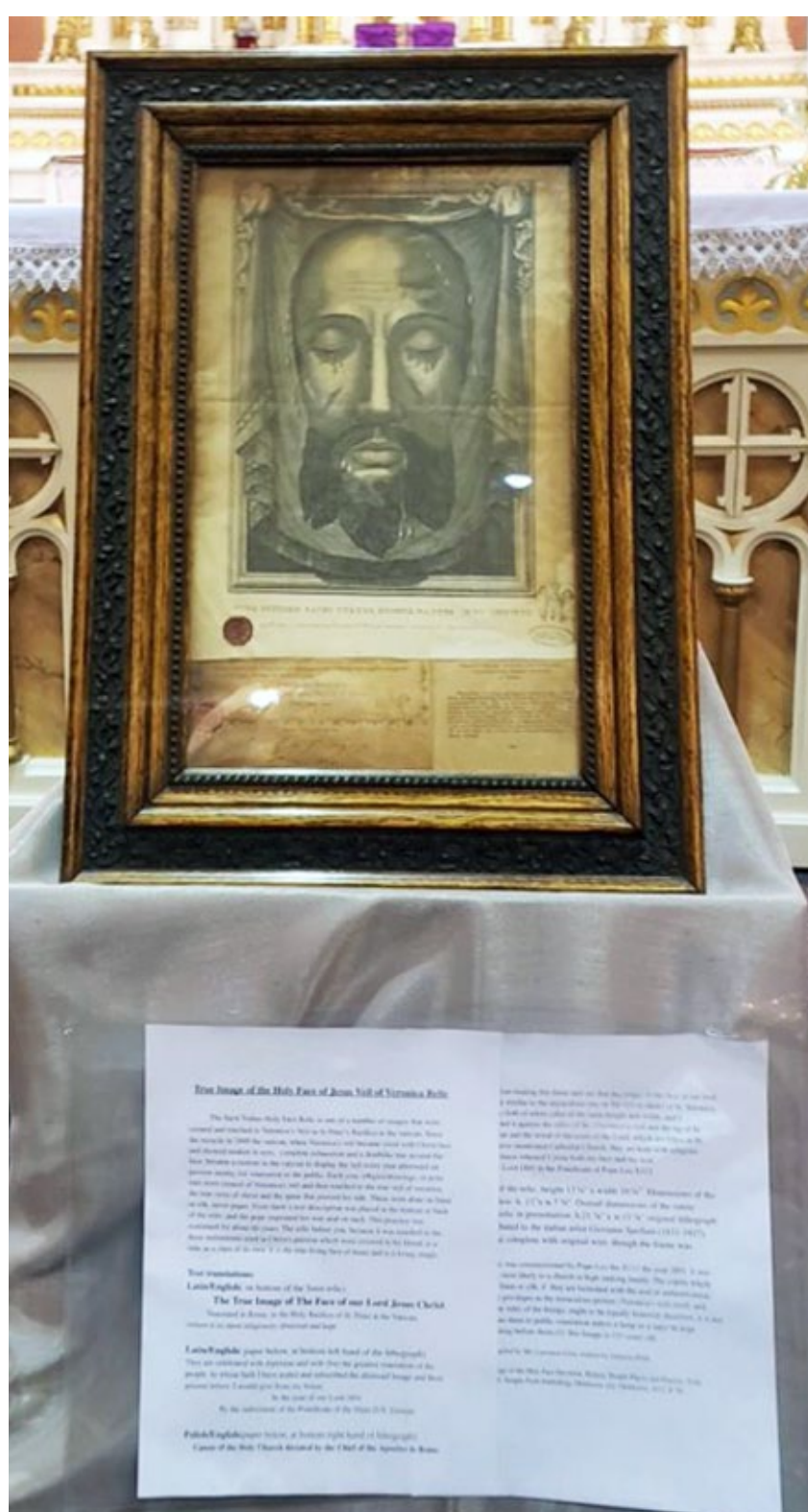
Mass in Reparation to the Holy Face on March 4, 2025