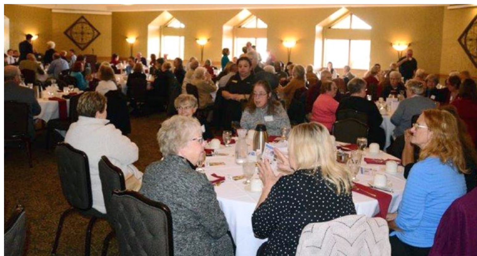
Annual Luncheon and Silent Auction