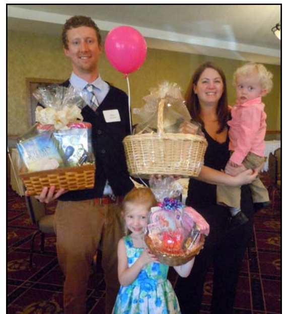
Happy family who had winning bids on several of the Silent Auction items at the 2014 CPO Luncheon & Fundraiser.

May we all see more than others see. May we all embrace a wider reality. We must beg God for the grace to see life with the eyes of the saints and in all humility learn to see Christ in others and be Christ to others. It is only the humility, love, and, yes, courage of faithful disciples of Christ that will bring light and clarity to the darkness and confusion of our times and allow others to discover that "wider reality" Who is God Himself. †